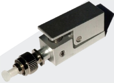
TK-35 FC Bare Fiber Adapter